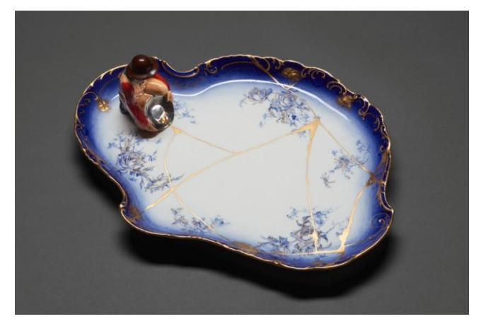
Penny Byrne, Veins of Gold, 2017, restored antique soft paste porcelain blue and white gilded platter, ceramic gold miner, epoxy resin, gold powder in the Japanese kintsugi

Penny Byrne's Veins of Gold (Image below left) presents a reconstructed platter and figurine. Byrne makes visible the hidden veins of gold that run through the country, whilst also referencing the gold that ran through the veins of miners and prospectors in Australia during the 1860s. Born in Mildura and currently based in Melbourne, Penny Byrne's sculptural works are politically charged, highly engaging and often disarmingly humorous.